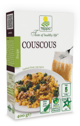
COUSCOUS INGREDIENTS: whole wheat couscous.