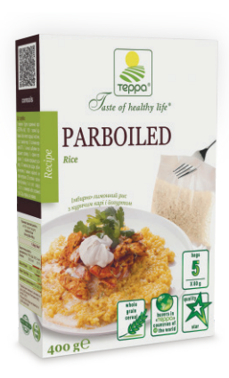
PARBOILED RICE INGREDIENTS: long grain rice parboiled.