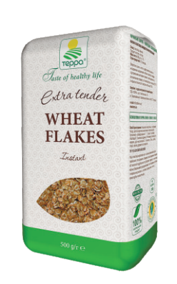
INSTANT WHEAT FLAKES INGREDIENTS: wheat flakes.