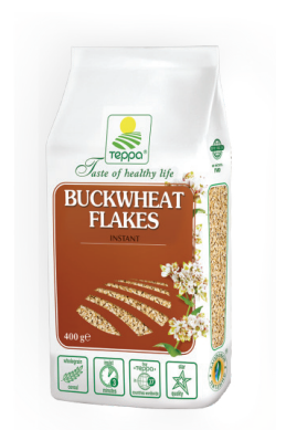
INSTANT BUCKWHEAT FLAKES INGREDIENTS: 100% natural buckwheat flakes.