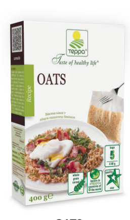
OATS INGREDIENTS: oats.