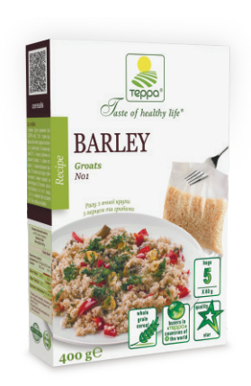
BARLEY GROATS NO. 1 INGREDIENTS: barley groats.