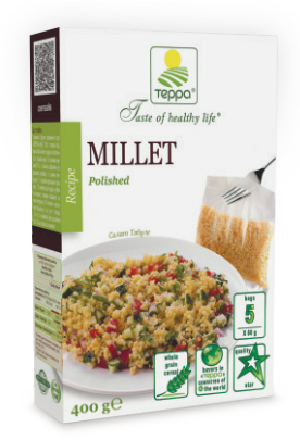
POLISHED MILLET INGREDIENTS: millet.