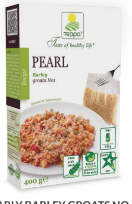
PEARLY BARLEY GROATS NO. 1 INGREDIENTS: pearly barley groats.