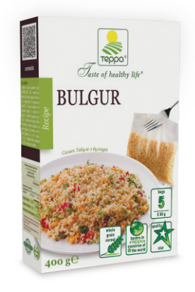
BULGUR INGREDIENTS: spring wheaten groats Bulgur.