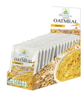
INSTANT OATMEAL INGREDIENTS: oatmeal flakes, sugar, salt.

INGREDIENTS: buckwheat flakes, powered cream, salt, freeze-dried mushrooms, dried onions, dried vegetables (onion, carrot, parsley, dill); ground black pepper and all spice, natural flavors "mushrooms".