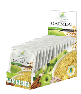
INSTANT OATMEAL WITH APPLE AND CINNAMON

INGREDIENTS: oatmeal flakes, sugar, freeze-dried pineapple, salt, natural flavors "pineapple".