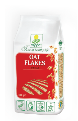
INSTANT OAT FLAKES INGREDIENTS: 100% natural oat flakes.