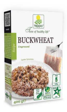
BUCKWHEAT UNGROUND INGREDIENTS: buckwheat.