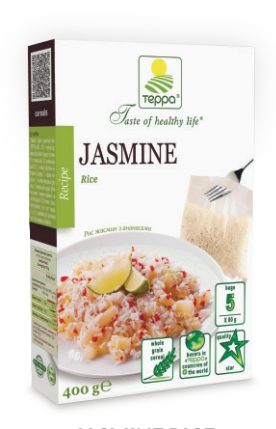
JASMINE RICE INGREDIENTS: long grain rice jasmine.